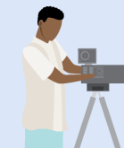
camera operator cameraman camerawoman