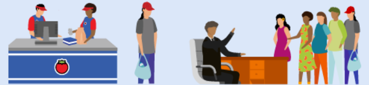
coworker colleague client customer team