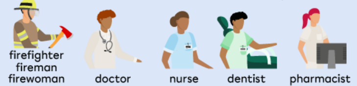
firefighter fireman firewoman doctor nurse dentist pharmacist