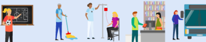
coach janitor nurse librarian bus driver