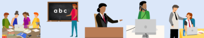
student teacher principal secretary counselor