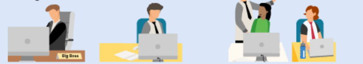
boss supervisor manager employee