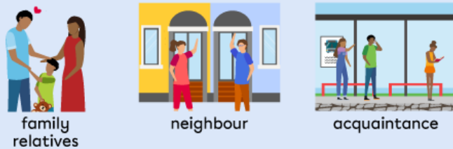
family relatives neighbour acquaintance