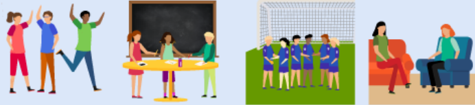
friend pal buddy classmate schoolmate teammate roommate